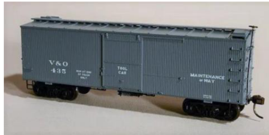
Gray V&O MOW #435

Pricing is $21.00 per car. Shipping (USPS) & handling is $10.40 for one car, and $18.40 for two or more cars via USPS. Ohio residents, please add 7.8% sales tax on the total price of the kits and the shipping/handling fee.