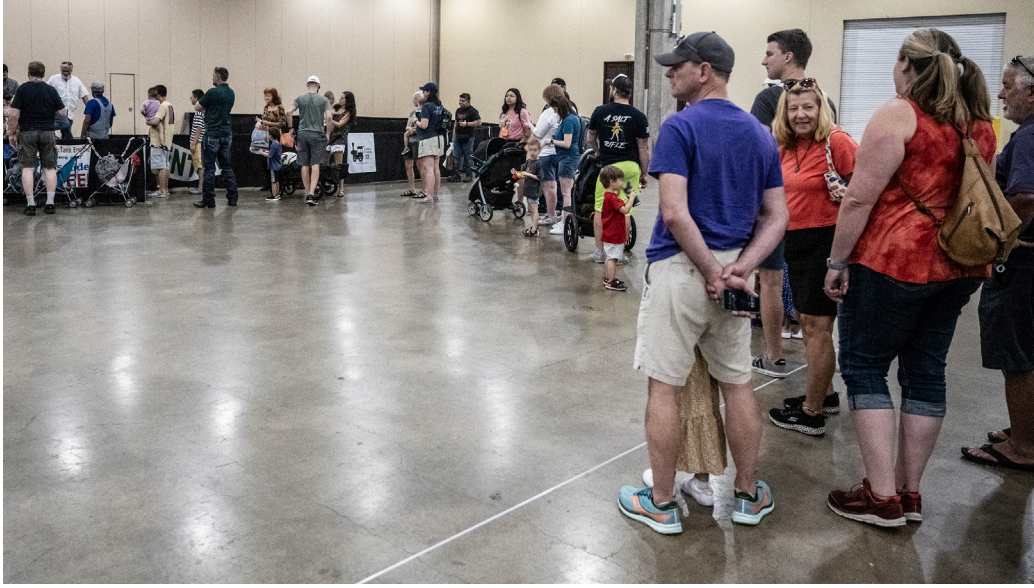
Long line for the train ride.

The National Train Show had the usual big name vendors and a good number of local dealers offering low cost items. The children's section was amazing, with lines and standing room only everywhere. The hotel seems to cater to families on the weekends, so add those kids to the ones from the surrounding Dallas Fort Worth vicinity and, you've got a lot of future NMRA members!