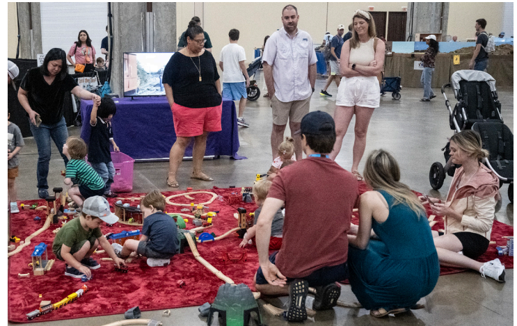
Do it yourself Brio style layouts.

The National Train Show had the usual big name vendors and a good number of local dealers offering low cost items. The children's section was amazing, with lines and standing room only everywhere. The hotel seems to cater to families on the weekends, so add those kids to the ones from the surrounding Dallas Fort Worth vicinity and, you've got a lot of future NMRA members!