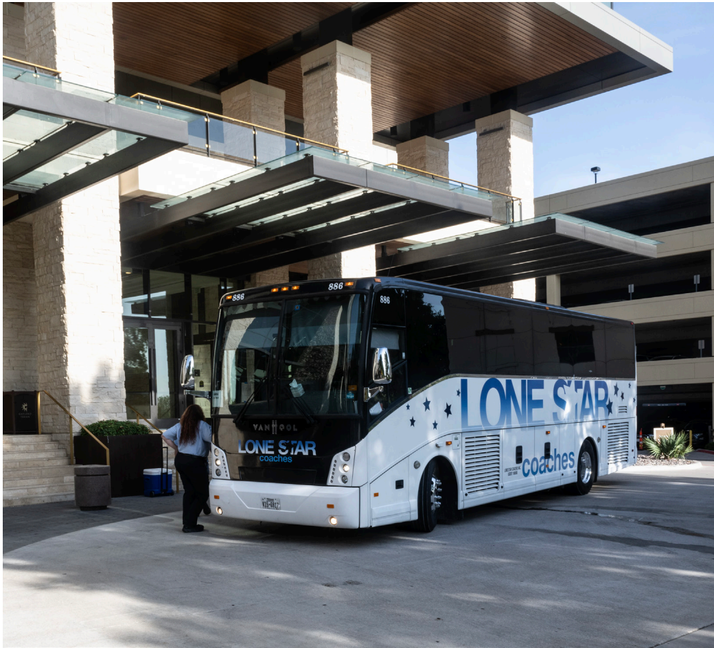
One of our tour buses waiting outside the convention area.