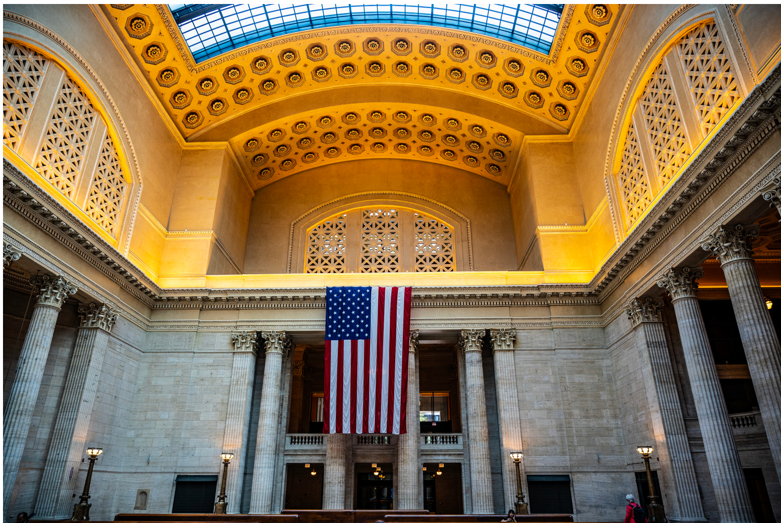
Union Station Chicago

Relevance? You might have been here if you took Amtrak to the National Convention. If you were there returning Monday night, the signal system died and Amtrak would have put you up in a fantastic hotel with an extra day to see the city. Or watch TV in the Metro Lounge after a long week,