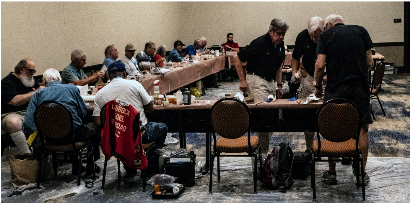
Modeling with the Masters® was back in full swing with multiple offerings. There were other hands-on clinics as well.