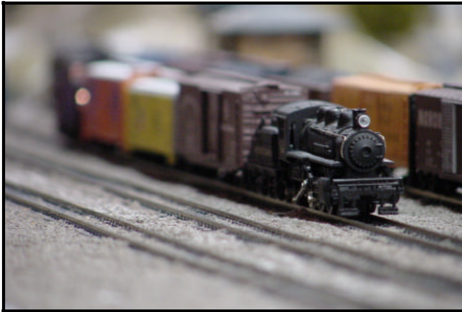
An 0-6-0 shuttles a short consist in the yard.