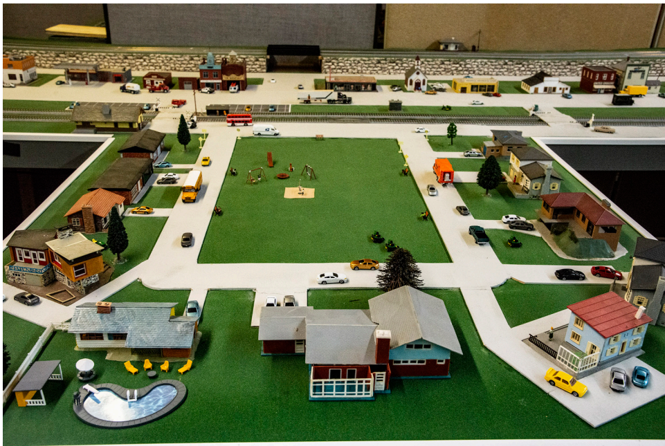
The HO layout doesn't neglect its residents as this peninsula demonstrates.