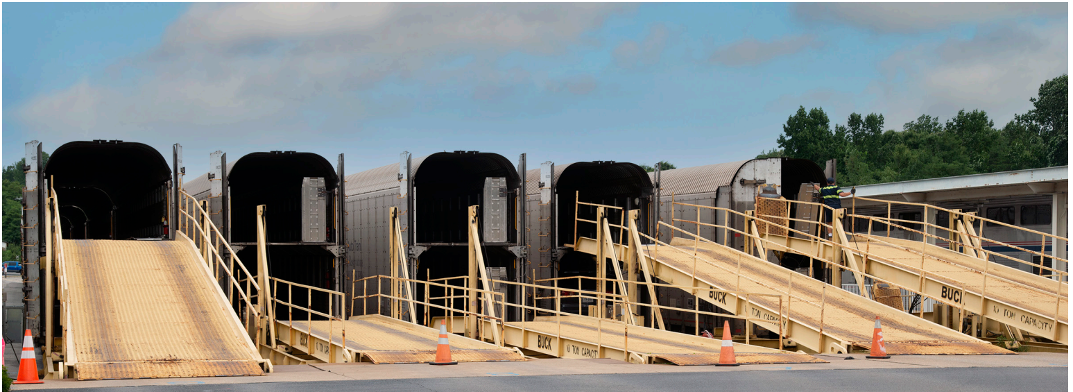
The Virginia end of Auto Train about to receive vehicles going to Florida.

This issue is mailed to all MCR members.