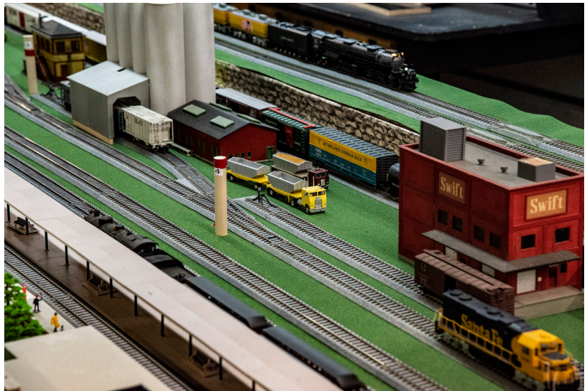
Easy-to-see markings such as the numbered turnout posts, make routing clear to visiting engineers.