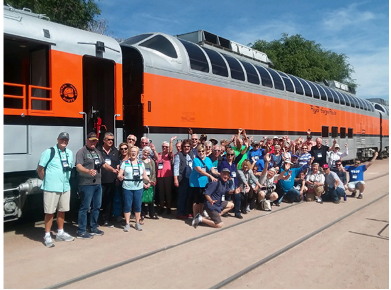
Tour group outside touring car