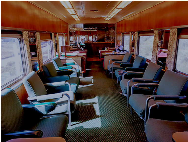
Observation Lounge car