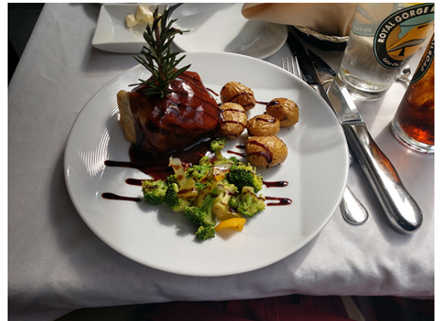
Beef Wellington dinner