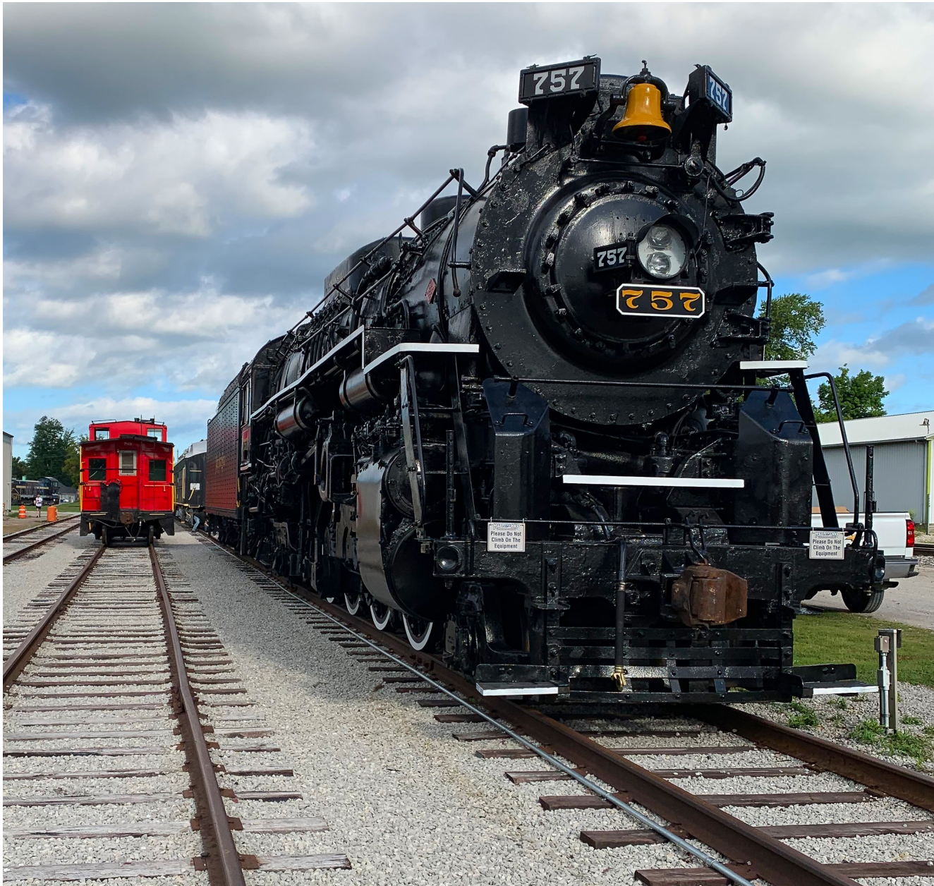
Nickel Plate Berkshire engine 757, back to its hometown in Bellevue Ohio at the Mad River & NKP Museum. This picture was taken late last summer when the museum hosted Division 4's annual "Far West" BOD meeting.