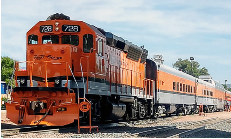
728 Royal Gorge diesel powered train