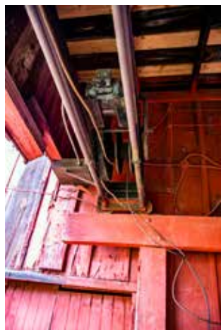
Far left: delivery trapdoor; near left: mechanism at top of delivery area. Hopefully the other pictures are obvious from the article.