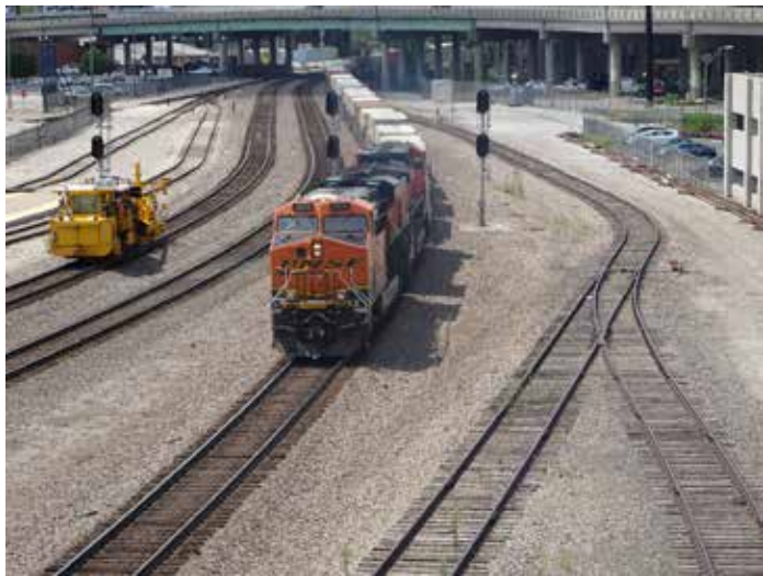
A view from the pedestrian bridge behind Union Station.