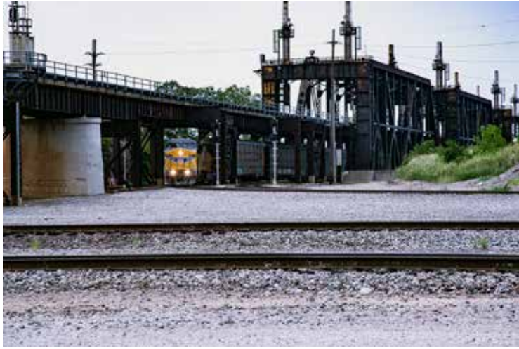
An area known as West Bottoms, relatively close to the hotel, with lots of activity. The bridge features two levels of tracks. The vertical extensions are screws to raise the bridge in case of flooding.