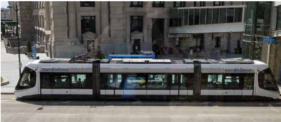
The free streetcar, shown waiting at the side of Union Station. The picture was taken from the walkway connecting Union Station and the hotel.