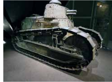
The World War One Museum contains one of the few remaining tanks from that war.