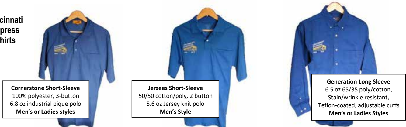
Cornerstone Short-Sleeve 100% polyester, 3-button 6.8 oz industrial pique polo Men's or Ladies styles