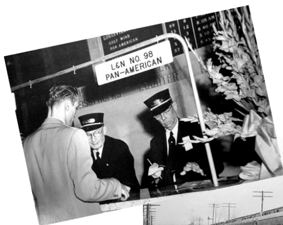
L&N Photos courtesy of Ron Flanary

Send in your completed registration now so that you can get your ticket to hop on The 2017 Pan-American in Louisville!