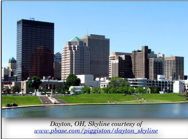
Dayton, OH, Skyline

We will have all the activities you have come to enjoy. We are planning model contests, displays, a company store,