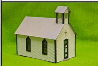
Building with the Masters.....