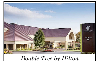
Double Tree by Hilton

Double Tree Suites by Hilton 300 Prestige Place, Miamisburg, OH 45432 937-436-2400 Group Code C-RRA