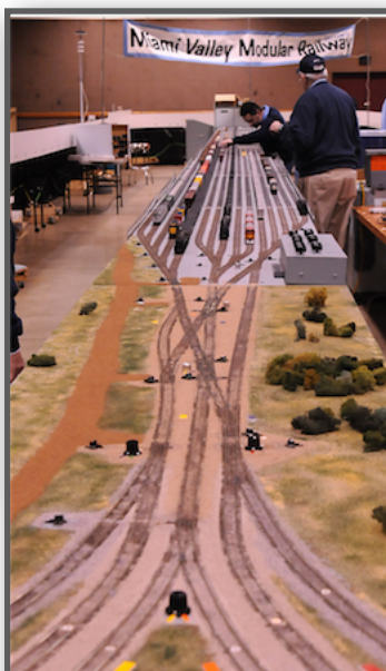
Miami Valley Modulars Staging Area