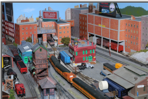
Denny LaMugusa' N Scale Great Northern