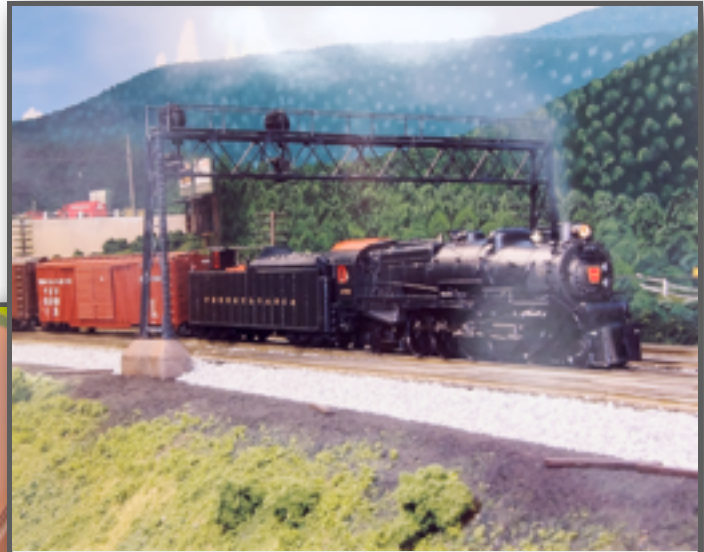
Best in Show – Photograph