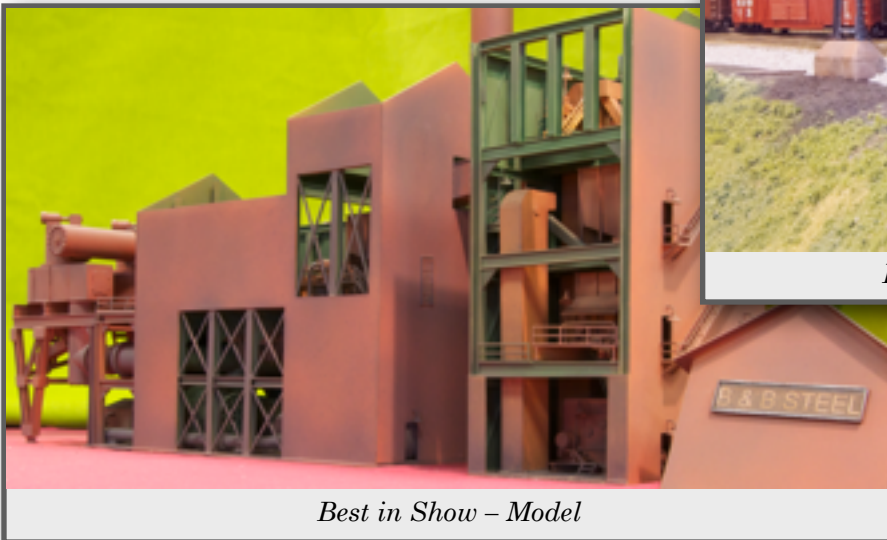
Best in Show – Model

HIGHLINE to Pittsburgh Contest Winners are available at: http://archive.midcentral-region-nmra.org/conventionFold/2012_convention/12_Index.html