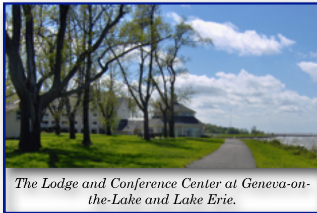
The Lodge and Conference Center at Geneva-on-the-Lake and Lake Erie.

Adjacent to Geneva State Park, our hotel location features breathtaking views of Lake Erie and the kind of relaxing getaway that is all too often hard to find. 109 guest rooms are available, including kings, queens, doubles, family rooms with bunk beds, whirlpool rooms and two room suites. Have a pet?..there are pet friendly rooms also available. In addition to our convention, the lodge has endless activities (although weather dependent), including bike rentals, paved bike path along Lake Erie’s shore, massage services, volleyball, indoor and outdoor pools, lake front fitness center, full-service restaurant, wine shuttle to local wineries, wine tastings on site, a game room, fire pits and so much more! All of this is available at the special convention rate of $95/night plus tax. Make your room reservations directly with the hotel via their online reservations