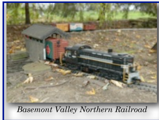
Basemont Valley Northern Railroad

We will have an assortment of different layouts on hand for you to visit and hopefully come away with some new ideas to incorporate into your layout. Our layout tours will take in four counties in Ohio and several in PA, so no matter which way you're traveling home, we'll have an outstanding assortment of N-scale through live steam layouts. The following is a partial list of layouts to see. Check back to our website as we draw closer to the convention to see our offerings.