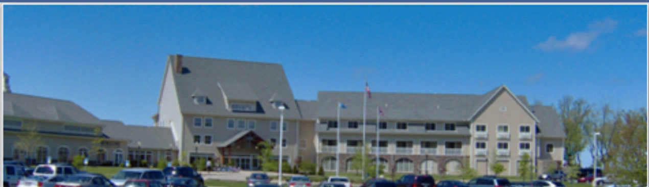
The Lodge and Conference Center at Geneva-on-the-Lake.