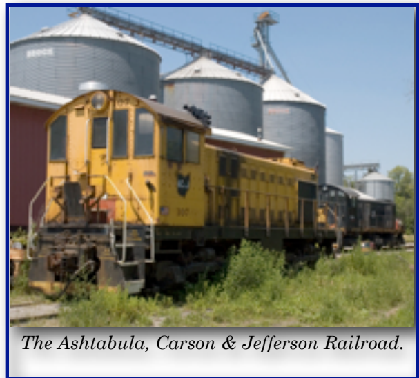
The Ashtabula, Carson & Jefferson Railroad.

The Ashtabula, Carson & Jefferson shortline railroad will add a caboose to their daily switching