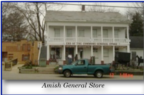
Amish General Store

NR-3 Amish Country Tour Friday PM Price $20 per person.